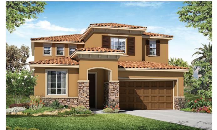
Elevation B - Italian