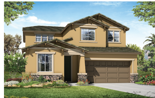
Elevation C - Craftsman